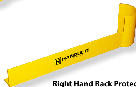
Right Hand Rack Protector