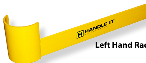
Left Hand Rack Protector

• Anchor Size: \frac{3}{4} " x 4.25" wedge anchor