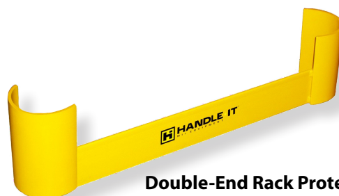
Double-End Rack Protector for Single Rows